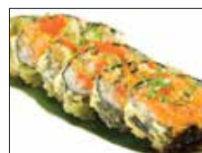
Crispy Salmon Roll