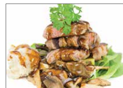
Grilled Rib Eye Steak