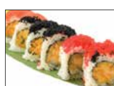
Spicy Scallop Roll