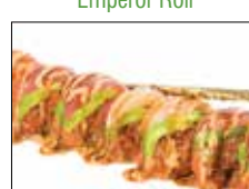
Angry Bird Roll