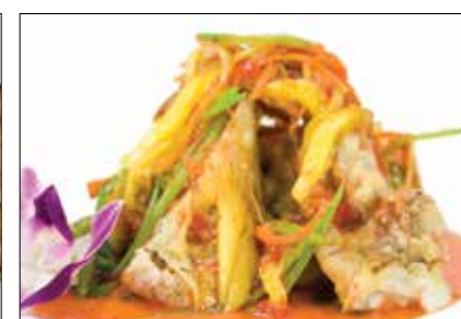
New Style Soft Shell Crab