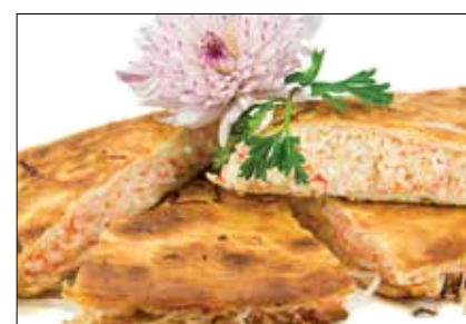
Blue Crab Fajita