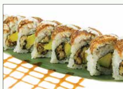
Snow Crab Wrap Crispy Spicy Salmon Wonton Tuna Tataki Dynamite Roll A & L Roll Tiger Roll Lover's Roll Crispy Dragon Roll