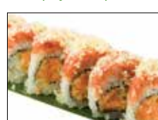
Double Spicy Roll